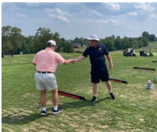
Knights from St. Michale the Archangel Council #18284 volunteered at last year's Northern Kentucky Regional Golf Tournament.

Aug. 8-8 – Region 3 Softball Tournament; Lyndon Recreation Center, Louisville