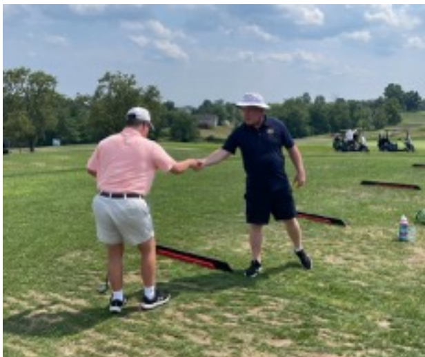
Knights from St. Michale the Archangel Council #18284 volunteered at last year's Northern Kentucky Regional Golf Tournament.

Softball leagues in Georgetown and Louisville have openings for scorekeepers. Our Regional