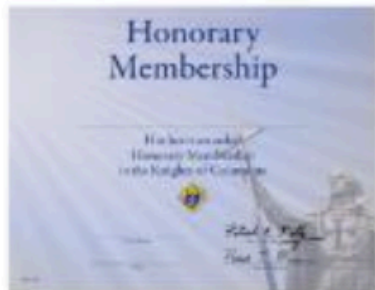
1457E Certificate: Honorary Member - English