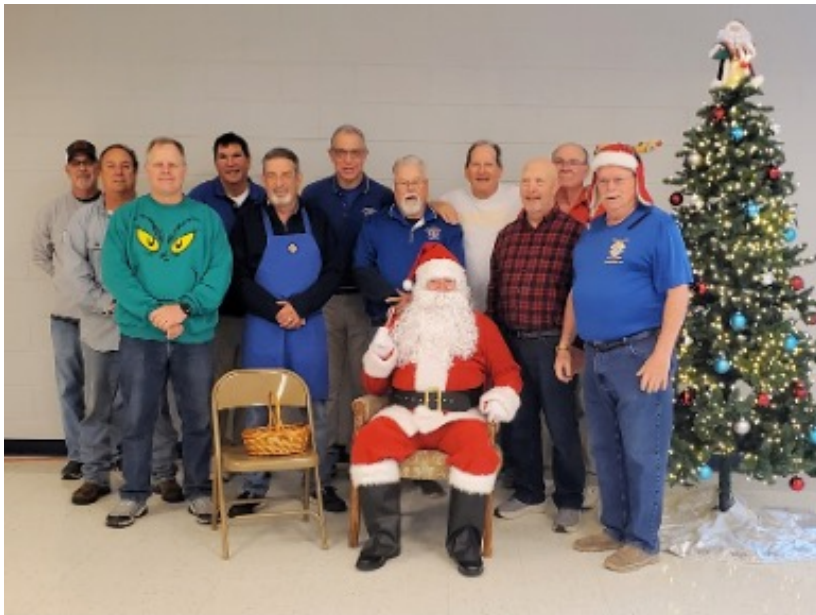
Santa's helper knights