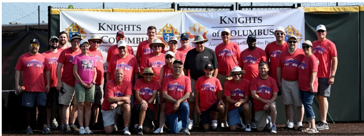
Knights at the softball throw event at the 2023 Special Olympics Kentucky State Summer Games.

If you ever have any questions about how your Council can become involved with or increase your involvement with Special Olympics Kentucky or a program in your area, please don't hesitate to reach out. You can always contact me at mbuerger@soky.org or (859) 338-6075.