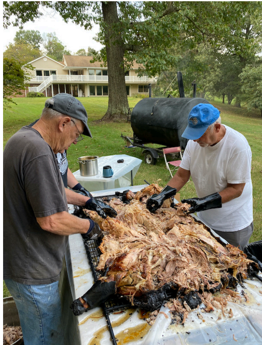
Knights of Council 11132 (Madisonville) Prep a barbequed whole hog for "Bluegrass on Beshear"

During its 9 years, "Bluegrass on (Lake) Beshear" has raised $153,535 for 4 life-affirming pregnancy care centers in western Kentucky. Alpha PCC in