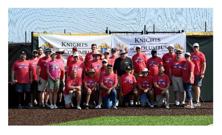
Dozens of Knights mainly from St. Mark Council #12852 once again served as the primary volunteers at the Softball Throw venue.

Once the Games were underway, Knights were there to volunteer as they have been for more than 20 years with St. Mark Council #12852 in Richmond leading the way. On Friday, St. Mark Council Knights answered an emergency call for help with the Friday night softball throw competition. They returned to the softball throw on Saturday with more than 35 Knights and family members. In all, Knights performed more than 250 volunteer hours at the Games.