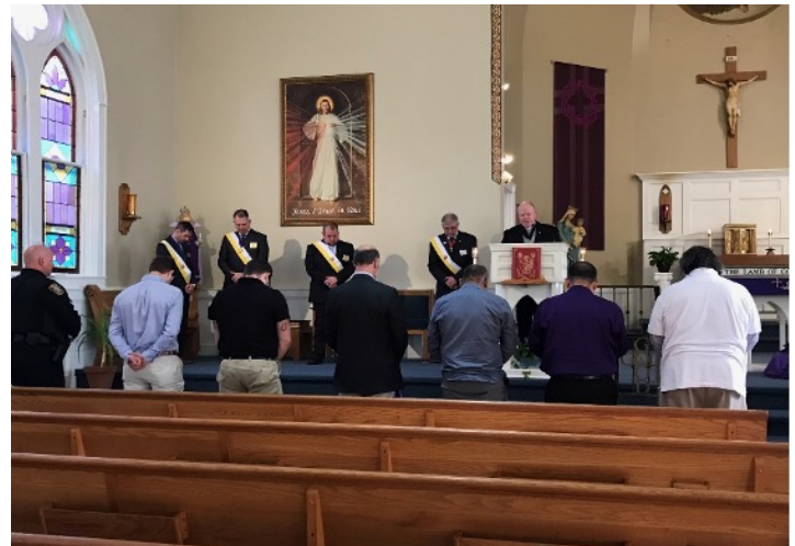
St. John St Francis Council 11470 – Georgetown

The Frankfort Council has achieved the membership goal of 10 new members. The Georgetown Council has achieved their membership goal of 9 new members and Christ the King Council 14130 has surpassed their membership goal & is shooting for “Triple Star”! CONGRATS TO ALL!