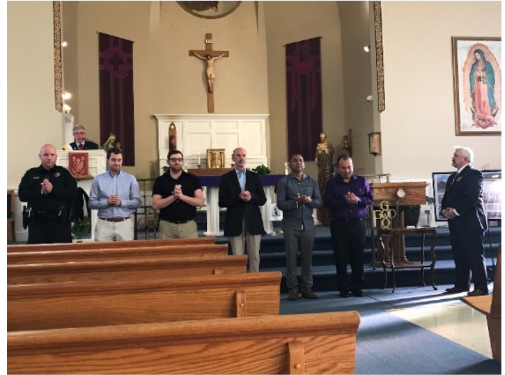
St. John St Francis Council 11470 - Georgetown