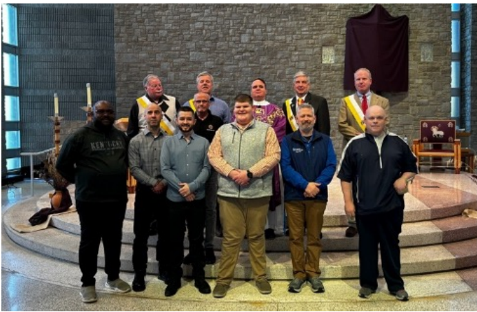
Frankfort Council 1483

Congratulations to Frankfort Council 1483, Georgetown Council 11470 and Lexington Council 14130 for making the last weekend of March an AWESOME weekend. Between the three councils they Exemplified 14 new Brother Knights and one Brother Knight advanced to the 3rd Degree.