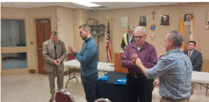
Christ the King Council 14130 - Lexington