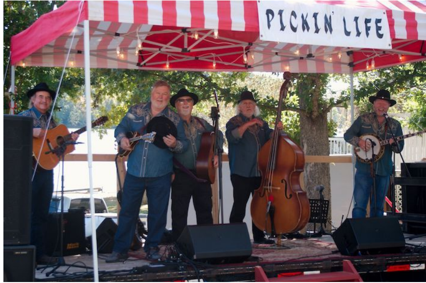
South Union Bluegrass Band opened "Bluegrass on Beshear - Pickin' Life" on Oct 8.

Bluegrass on Beshear's stated objectives are to increase public awareness of the existence and services of local pro-life pregnancy care centers and to raise money for them. In its first year, 2014, "B on B" raised a modest $2600. The fundraising amount has been surpassed in each succeeding year. This year, the event set a new record by raising $38,592, which is divided by 3 and presented to each of the pregnancy care centers. During its 9 years, the "B on B" music festival has raised a total of $153,535. Every dollar has been