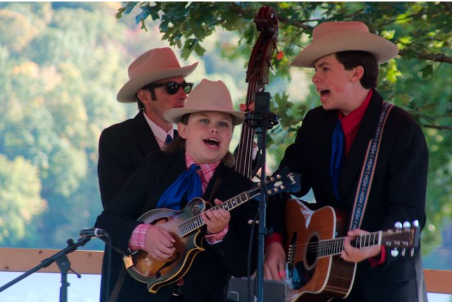
Classy and Grassy lit up the stage at "Bluegrass on Beshear - Pickin' Life".

Supreme's new Aid and Support After Pregnancy (ASAP) program increased the impact of "B on B" in 2022. The ASAP program donates $400 to a designated pregnancy care center when a Knights of Columbus council or assembly raises $2000 for the center. Since 6 councils were involved in raising $38,592 for 3 pregnancy care centers, each council qualified for the ASAP program's maximum $400 award to each pregnancy care center. This makes the ASAP program's additional fundraising