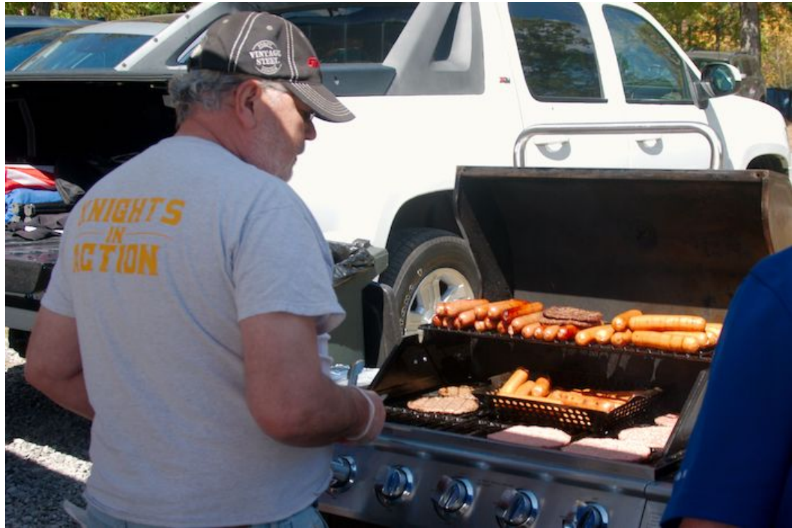
Knights from Council 7847 provided hot dogs, brats and hamburgers for "Bluegrass on Beshear - Pickin' Life".

hog for the event and serves its famous Lemon Shake Ups there, as well. Council 10988 (Calvert City) has made generous sponsorship donations since 2017. Council 6897 (Murray) began making sponsorship donations in 2019 and Council 11453 (Hardin / Aurora) joined this year. To top it off, the Kentucky State Council, through its Culture of Life Fund, has made a generous donation every year since 2017.