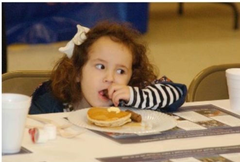
Enjoying her breakfast, but keeping her eye on Santa's location