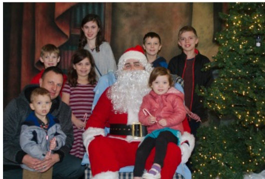
Fun for the families!