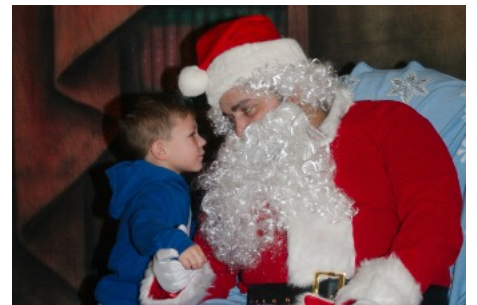
A young man tells Santa what he wants for Christmas