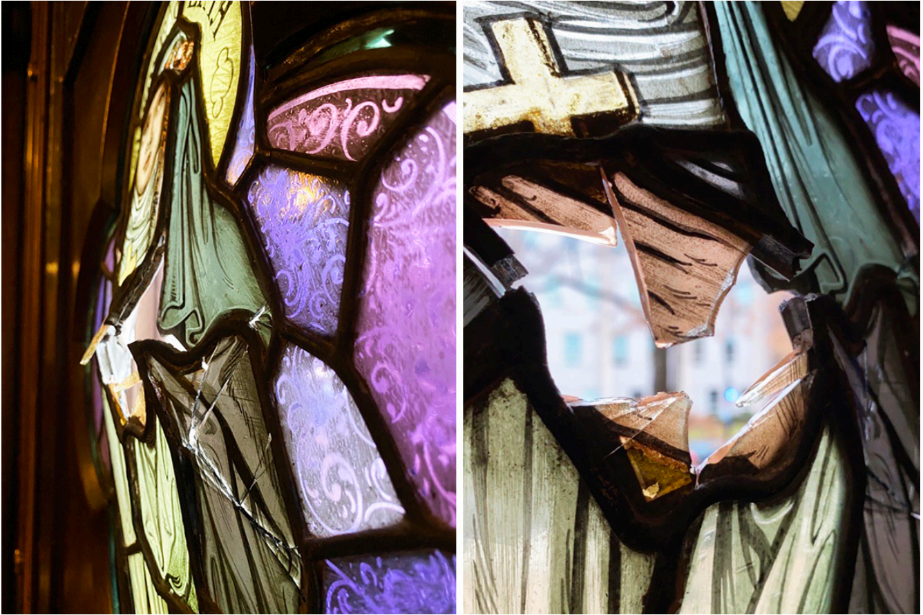
The St. Rose of Lima window at St. Mary Church in New Haven, Connecticut