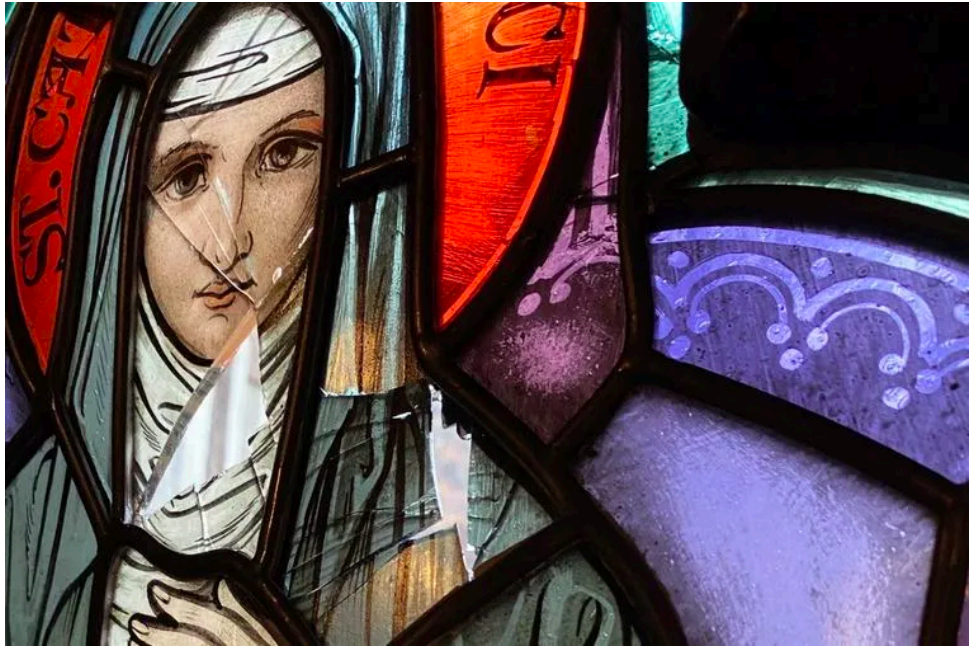
The St. Catherine de Ricci window at St. Mary Church in New Haven, Connecticut

On Saturday, Feb. 27, St. Mary Church in New Haven, Connecticut, was the victim of a vandal or vandals. The parish church is also renowned with a shrine of the Infant of Prague and known as the birthplace of the Knights of Columbus. Blessed Michael McGivney, founder of the Knights, is entombed in a sarcophagus in the church.