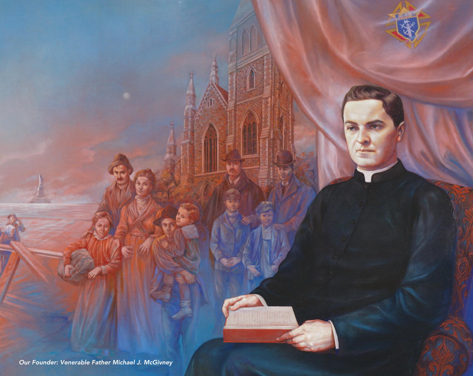
Our Founder: Venerable Father Michael J. McGivney