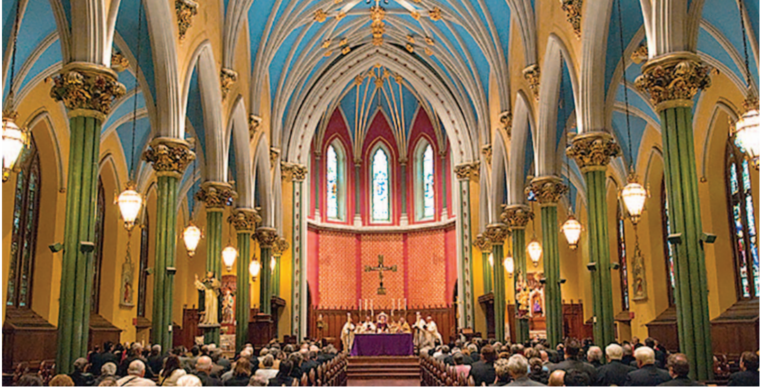
St. Mary's Church, New Haven, Conn.

It may seem counter-intuitive that a Catholic organization, and one of the world's largest charitable organizations, would be in the life insurance business. But it's not odd at all. Providing financial protection for Catholic families has been at the core of the Knights of Columbus mission since the beginning.