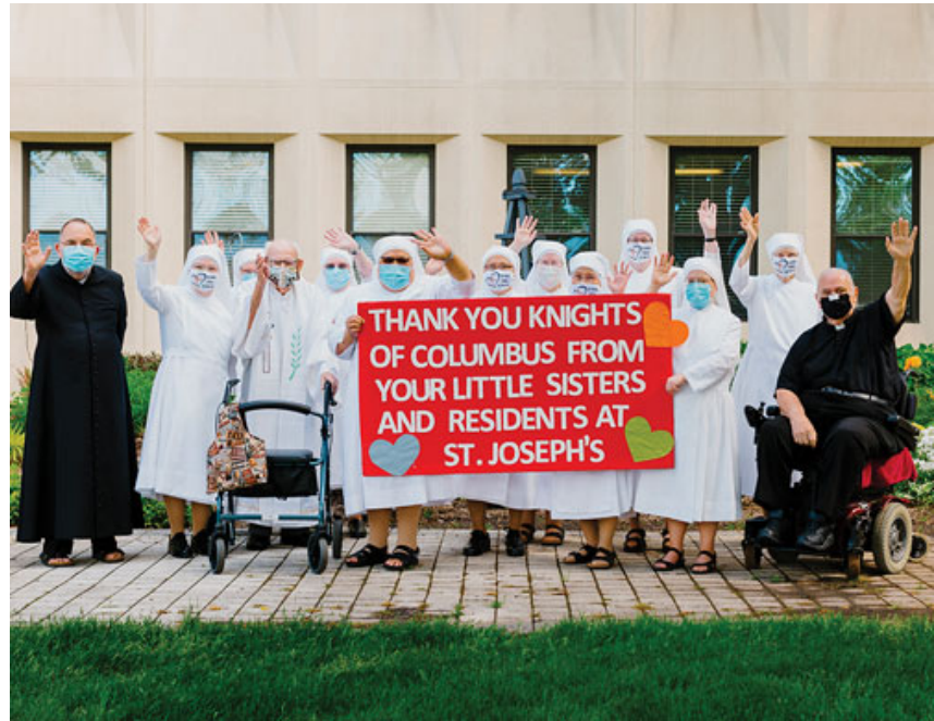
Sisters and several priest residents at the St. Joseph's Home in Palatine, Ill., express their thanks to the Knights of Holy Ghost Council 4977.

Since they were founded in France by St. Jeanne Jugan in 1839, the Little Sisters of the Poor have expanded to more than 30 countries. They live with and care for the elderly poor of every race and religion, and traditionally have sustained their homes by begging in the community. Over the years, the Knights have supported the Little Sisters in many ways, from