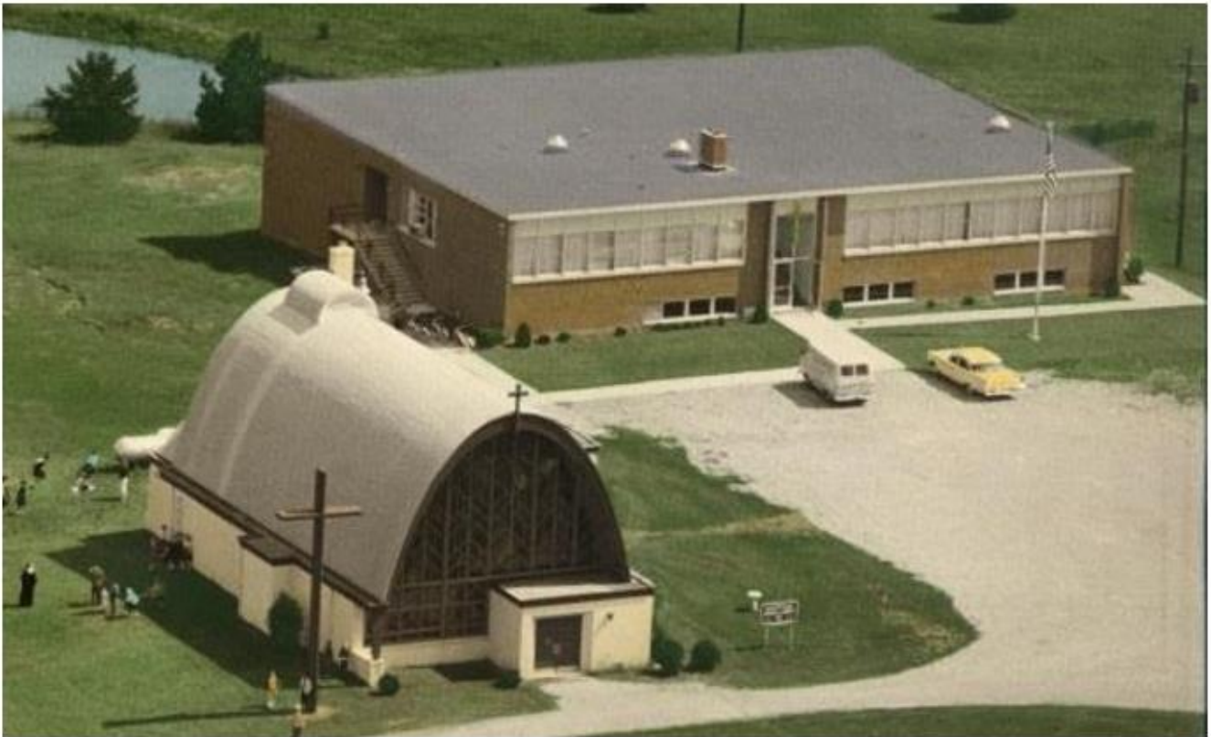
Aerial photograph of IHM Church and School. Circa 1962.

The council's original meeting location was in the basement of the old Immaculate Heart of Mary School located on Limaburg Road in Hebron, KY, near the Greater Cincinnati Airport.