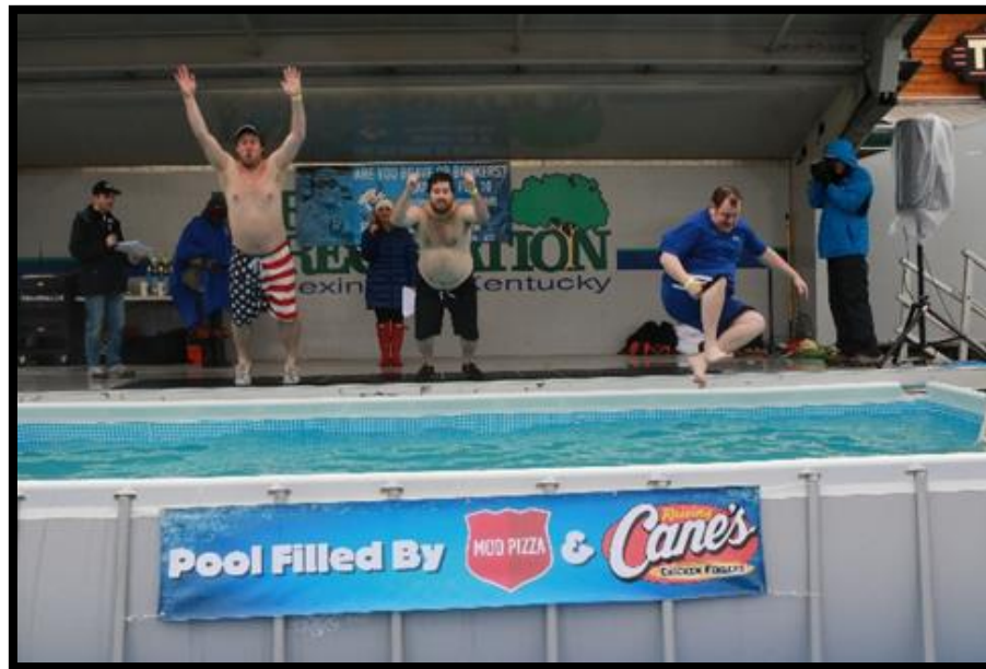
Knights from Mary Queen of the Holy Rosary Council #14372 took the Polar Plunge in Lexington in 2018

The 2019 Polar Plunge season – the most important fundraising time of the year for the program – is coming up. The Plunge is a great way for Councils or individual Knights to show their support of Special Olympics. The Plunge works just like a walk-a-thon, except that instead of going for a stroll, you take a dip in a cold body of water – either a pool or a lake depending upon location. With five events statewide, there is one near your council. Make plans to be Freezin' for a Reason now! For more information about the event nearest you, visit soky.org/polarplunge .