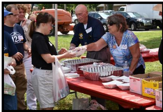
Knights from Bishop Flaget Council #13053 provided meals at the Special Olympics Kentucky 50th Anniversary Celebration.

Knights from Bishop Flaget Council #13053, along with friend from the International Brotherhood of Electrical Workers, donated, cooked and served meals to the nearly 500 athletes, volunteers and family members who attended the event and a presentation was made to the Knights of Columbus for their longtime support of Special Olympics Kentucky.