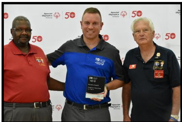
The Kentucky Knights of Columbus were presented with a Pioneer Award at the 50 th Anniversary Celebration, recognizing their longtime support of Special Olympics Kentucky programs.