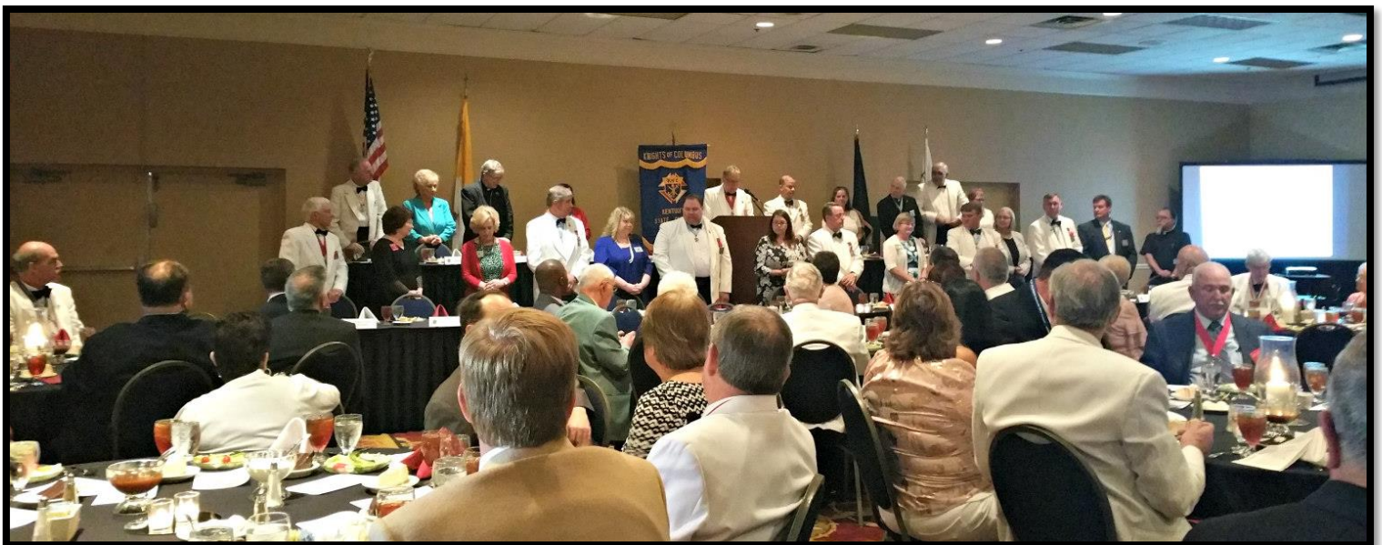
Head banquet table