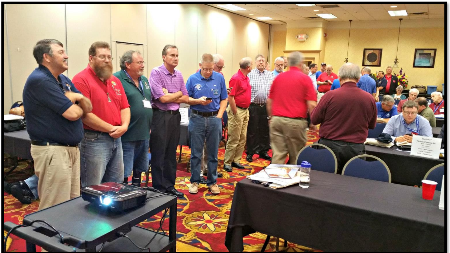
Various council award recipients