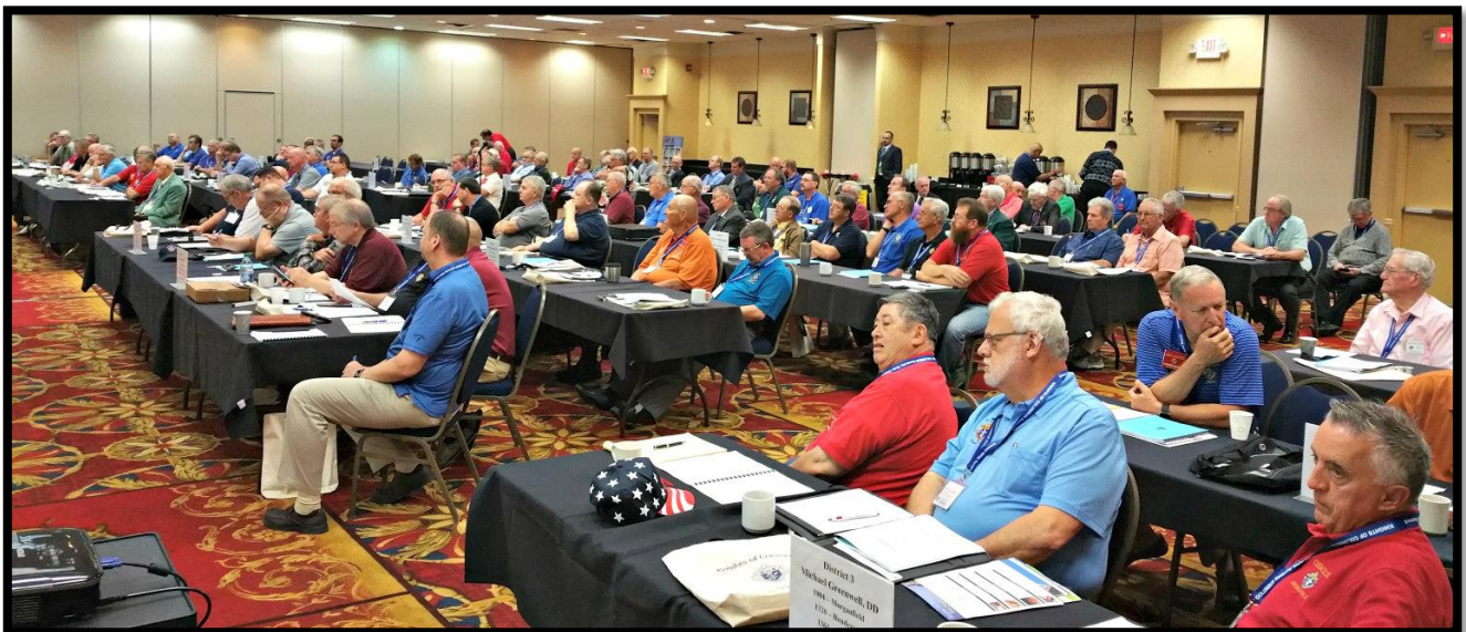
Kickoff for the State Convention