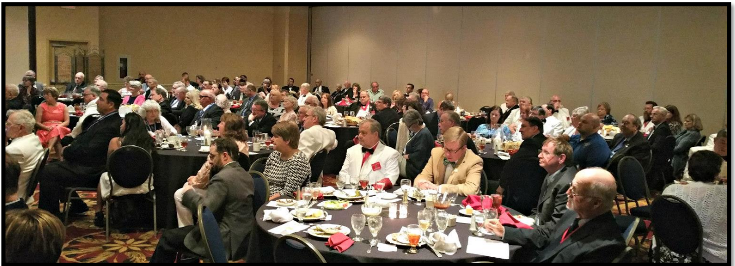
Various banquet attendees