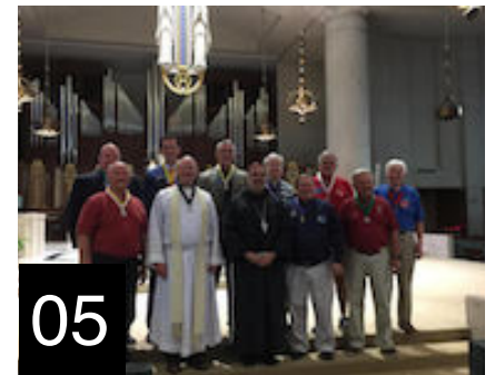
$7,000 CHECK FOR ARHHC, INC.