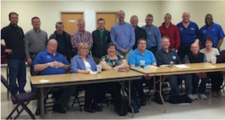
Council 15211 Union