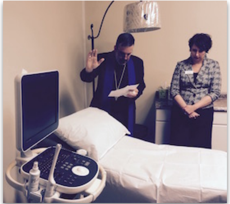
St. Mark Council 12852 presents a $21,750 check for an Ultrasound Machine to the Pregnancy Help Center in Richmond.