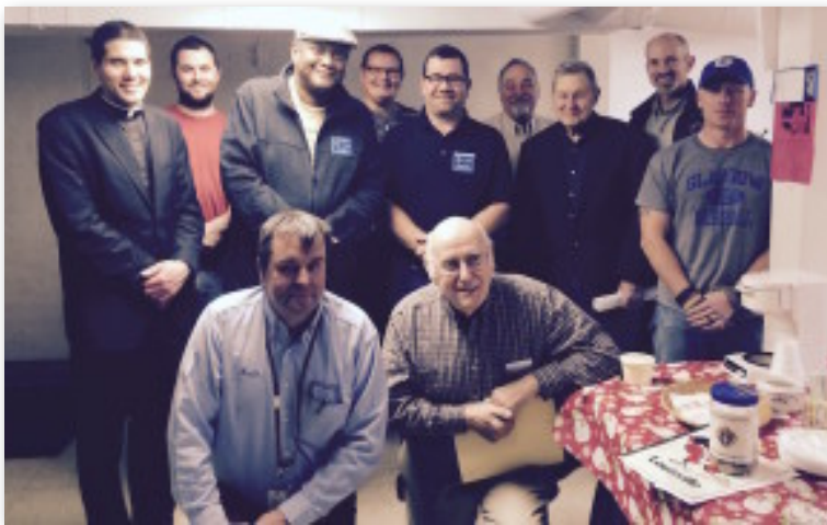
Council 6368 Glasgow