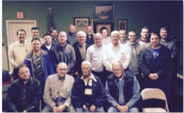
Council 1264 Lebanon