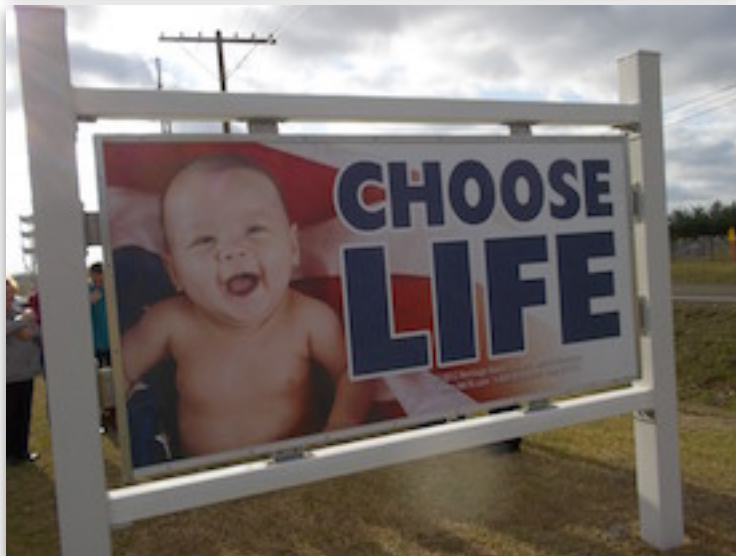
Council 1367 installed a new two-sided billboard to help support the Culture of Life.

Council #14130 in Lexington collected donations of care packages. Toiletry-type items were collected and distributed to Women’s Hope Center, Men’s Hope center, and Catholic Action center during December and January. Over 500 pairs of socks – matched, unmatched, new / old ... but all clean, were collected in January and taken to Catholic Action Center.