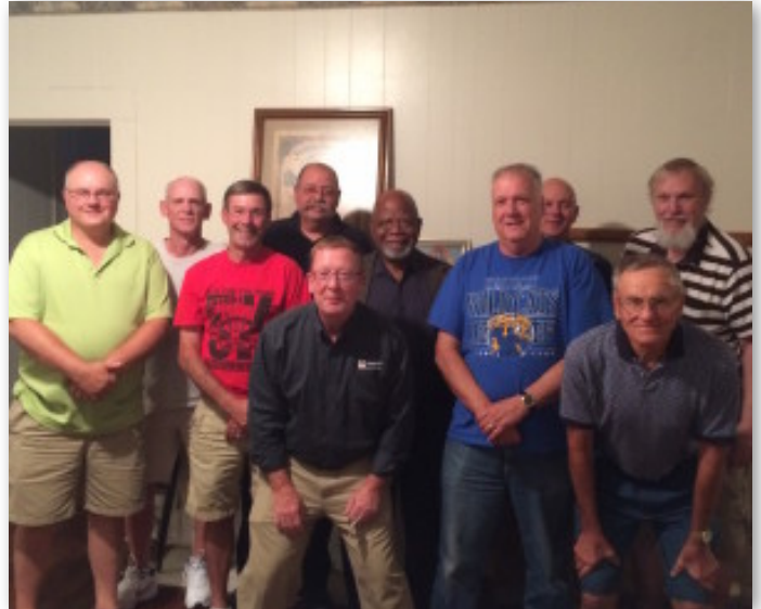
Council 1487 Ashland