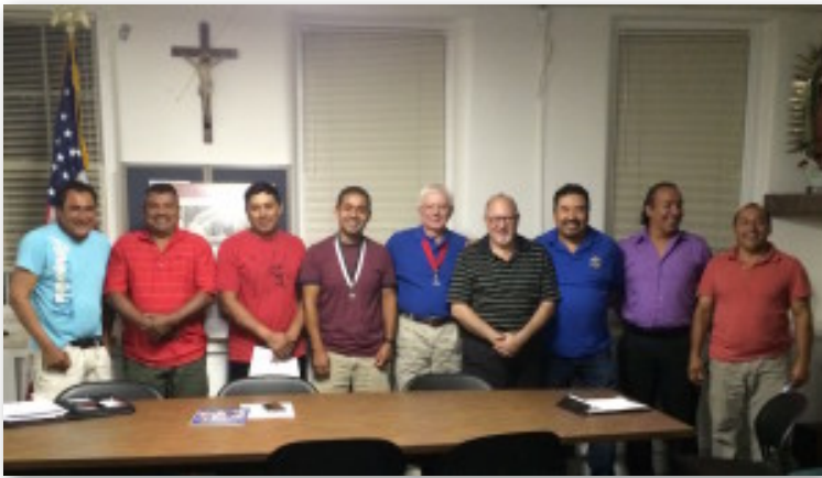
Council 15707 Lexington