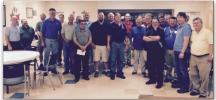
Council 762 brought in two new members at their first meeting of the new fraternal year.