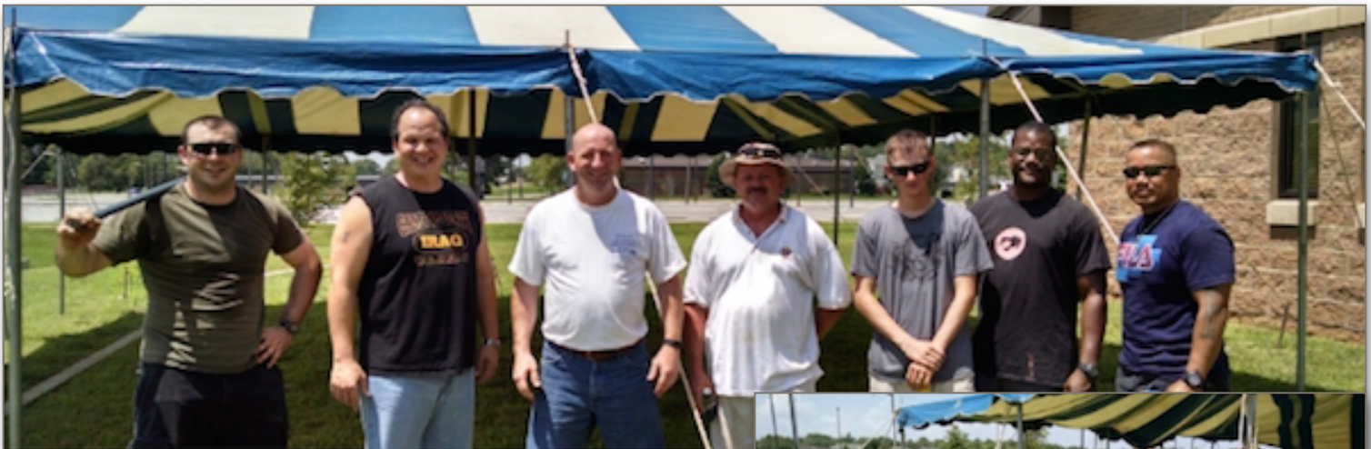
With more than 4,000 Families living on post, the Ft. Campbell Knights of Columbus are proud to assist with the set up for the Ft. Campbell Vacation Bible School Sunday July 12, 2015. As Catholic men of faith, we spread God's love with our Ft. Campbell families.