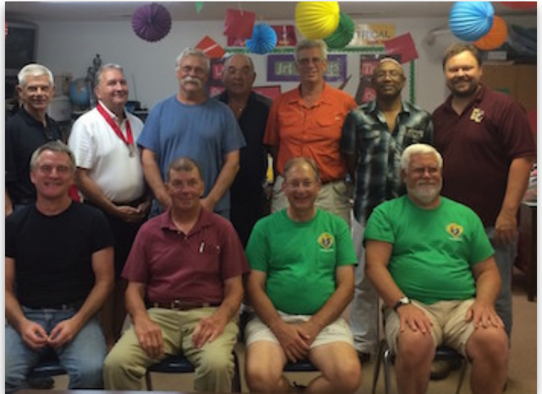
Council 1955 Paris