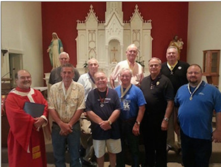
Council 14234 Taylorsville