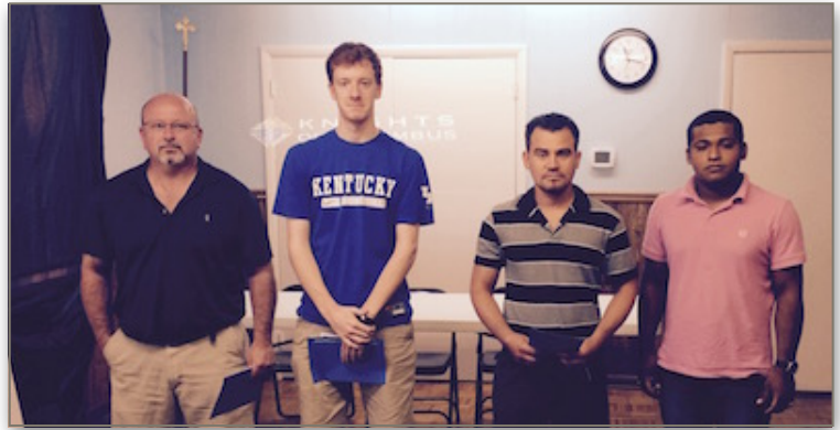
Council 1004 Morganfield