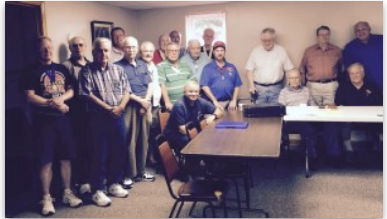
Council 4665 Louisville