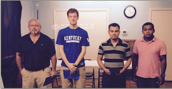
Our four newest brothers brought through the first degree at Morganfield council 1004 on June 14, 2015.