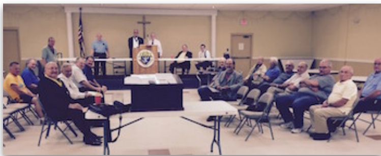
Council 4473 Assumption