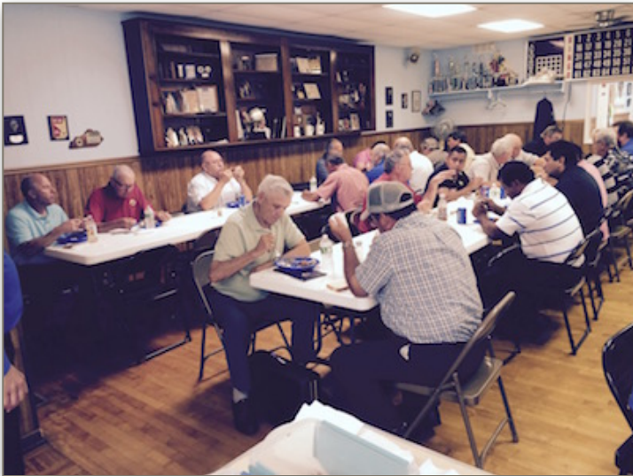
Thirty-five Knights from councils throughout southwestern KY enjoying lunch after they were brought through the third degree on June 14, 2015 at Morganfield council 1004.