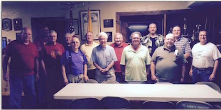
Council 10263 St Luke in Nicholasville voted to donate three $500 scholarships to area youth. They do this every year.