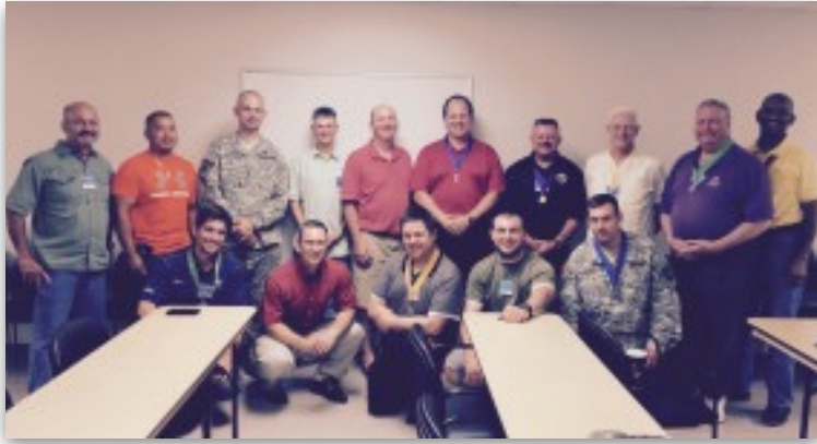
Council 15914 Fort Campbell