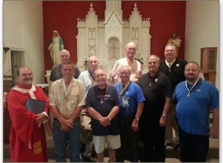
Council 14234 Taylorsville Officers Installation.