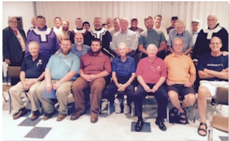
Fr. Bealer Council 3908 held a first degree and brought in two new brothers.