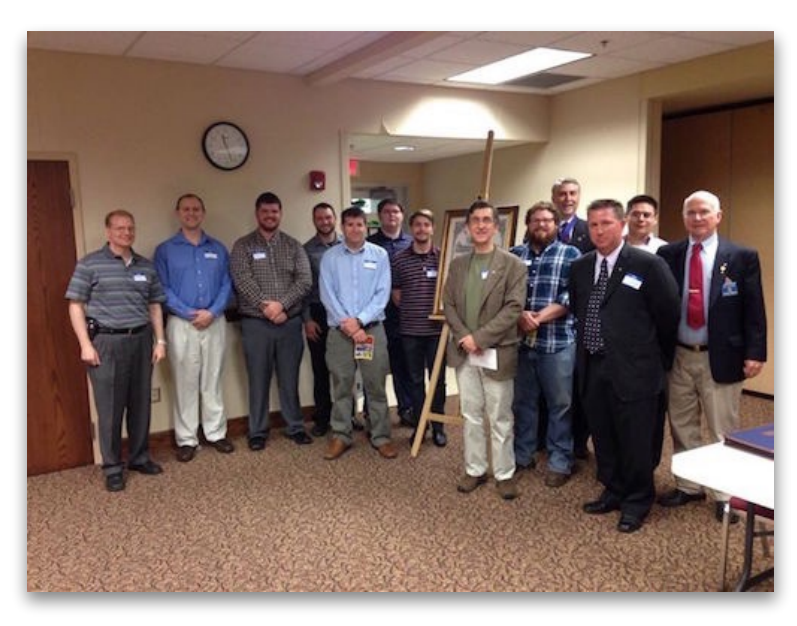
Council 14130 brought in 11 new Knights.