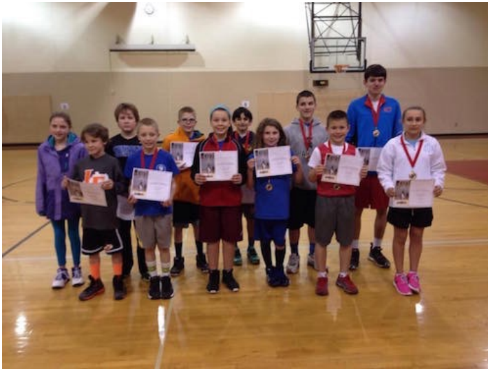
The winners of the Lexington Diocese’s regional free throw contest.